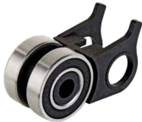
OEM# 6529.14082BG OTC-5661-J-ASSY

An exact match to the Jag Roller sets at a more affordable price! Built to last.