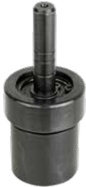
BOLT AND ROLLER STRAIGHT ASSEMBLY OEM# 106.256BG OTC-5610-J-ASSY