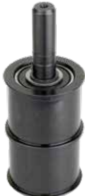
BOLT AND ROLLER DOUBLE HUBBED ASSEMBLY OEM# 6567.18014BG OTC-5630-J-ASSY