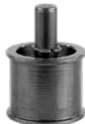
SHORT BOLT AND ROLLER HUBBED ASSEMBLY OEM# 6509.18025BG OTC-5650-J-ASSY