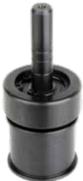
BOLT AND ROLLER HUBBED ASSEMBLY OEM# 106.255BG OTC-5620-J-ASSY