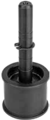
BOLT AND SINGLE ROLLER OEM# 106.257BG OTC-5600-J-ASSY

Made with quality steel, and coated to prevent rust. Our Jag rollers offer a universal bolt that can be used with several of the Jagenberg belt rollers!