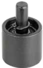
BOLT AND ROLLER STRAIGHT ASSEMBLY OEM# 6509.18023BG OTC-5640-J-ASSY