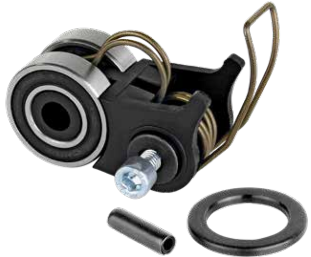
OEM# 5656.15022BG OTC-5660-J-ASSY

An exact match to the Jag Roller sets at a more affordable price! Built to last.